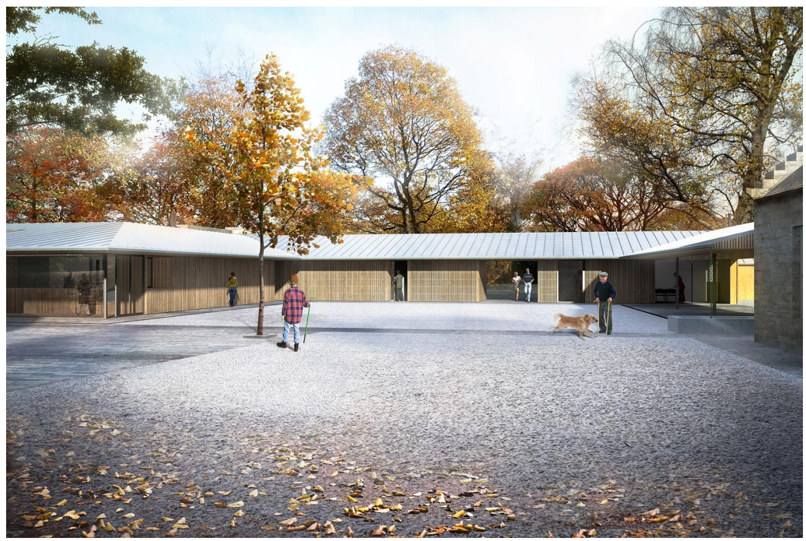
View of Stables Courtyard