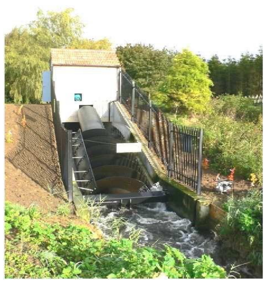
Example of a Micro-Hydro Scheme