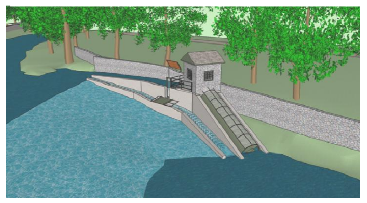
Diagram of the proposed Saughton Micro-Hydro Scheme