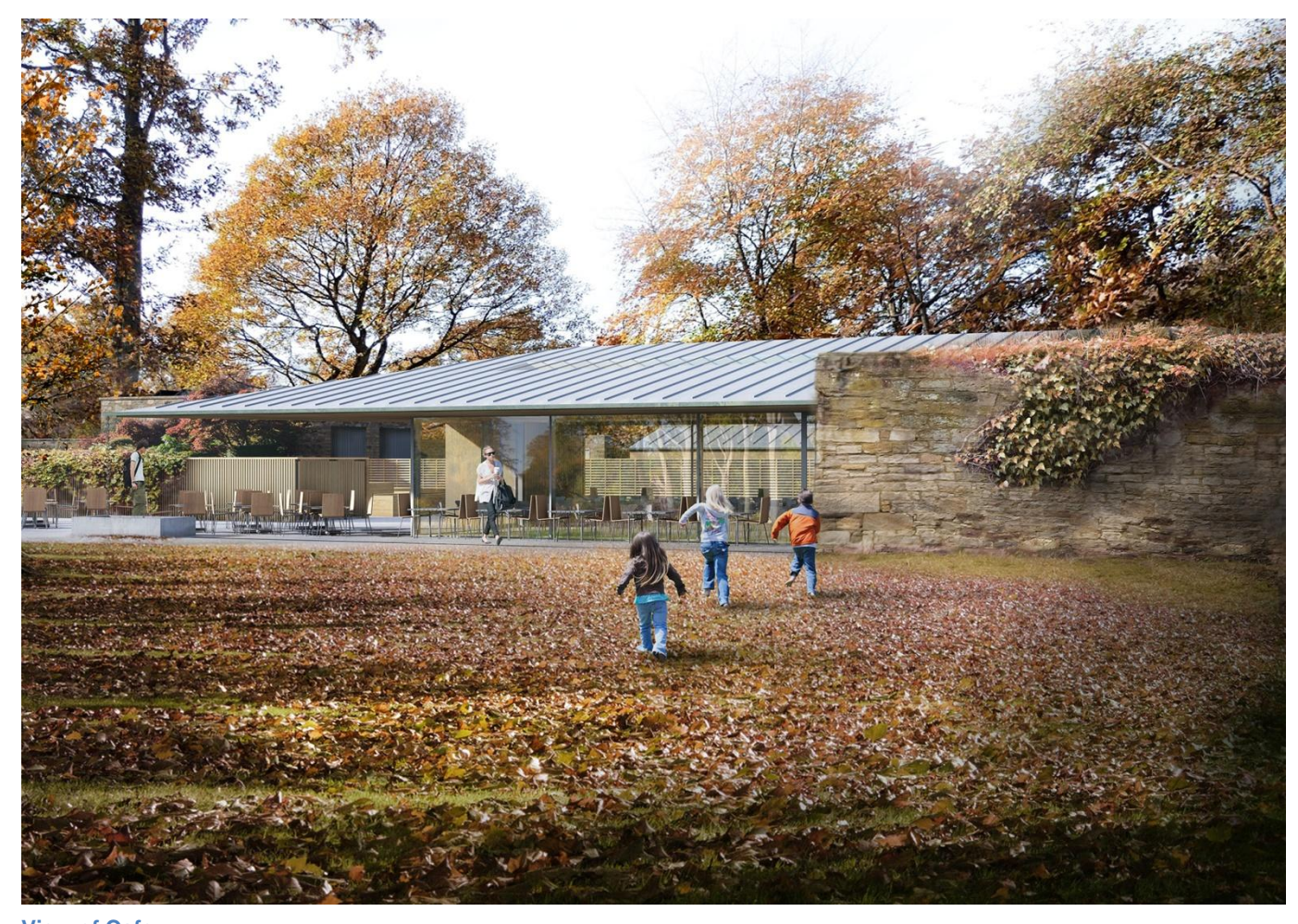
View of Cafe