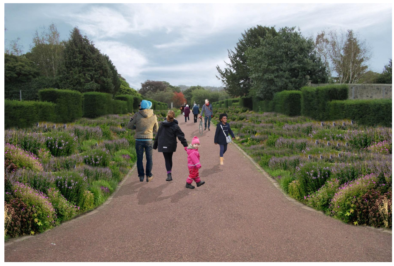
New herbaceous borders along Grand Avenue