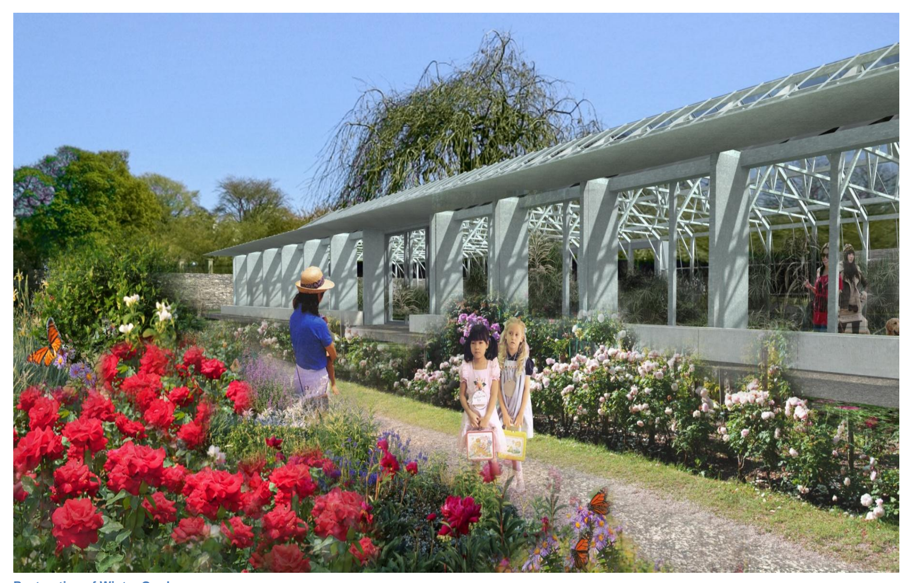
Restoration of Winter Gardens