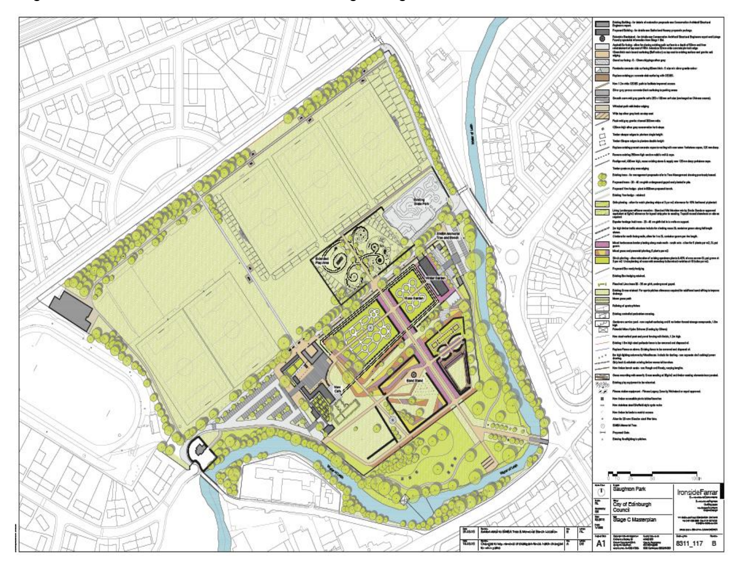
Appendix 2: Saughton Park and Gardens Master Plan & Design Images