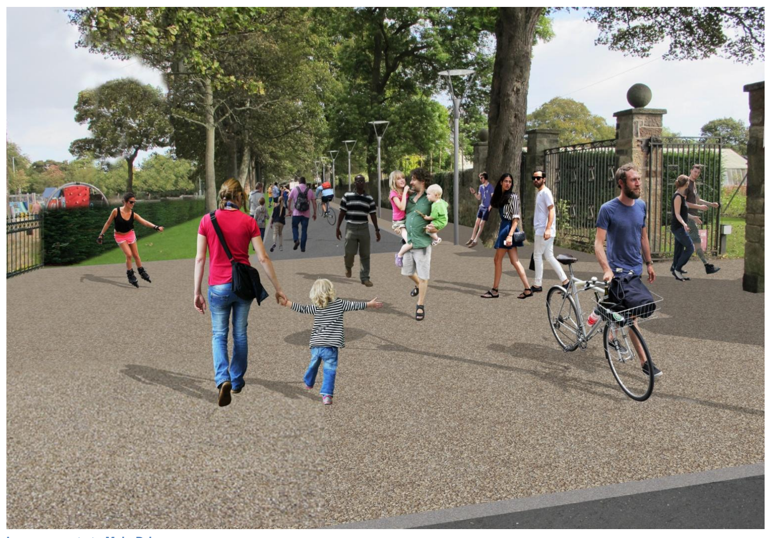
Improvements to Main Drive