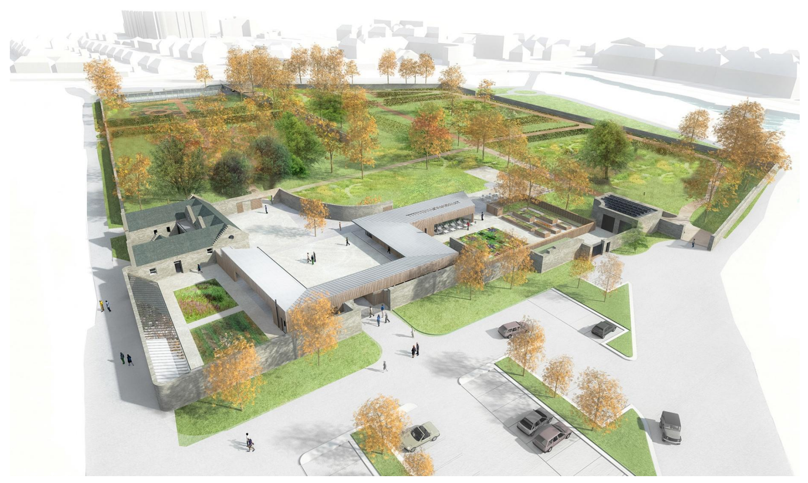
Stables, Courtyard and Café to the West of the Walled Gardens